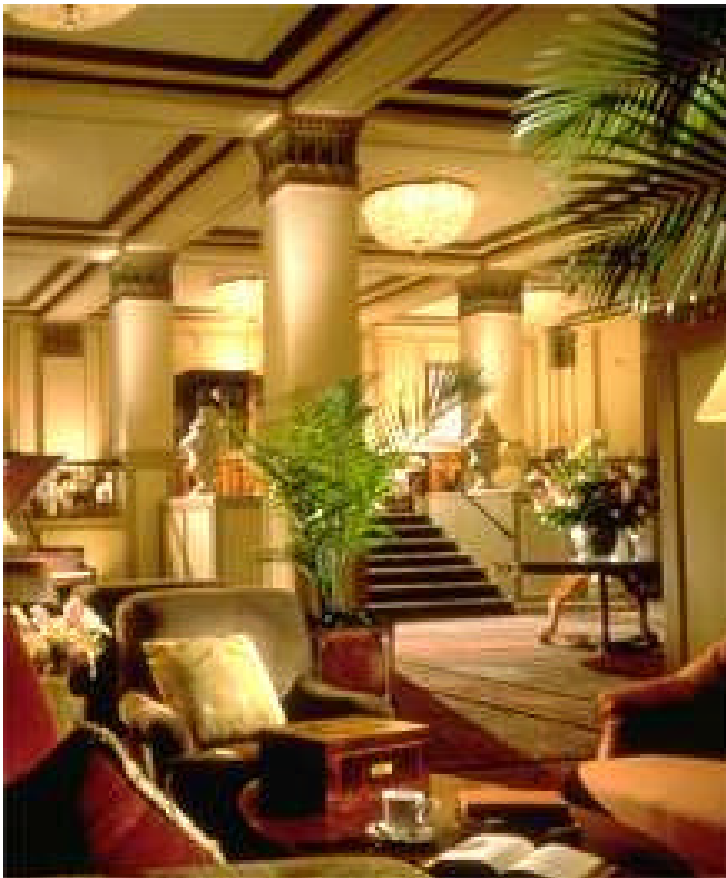
Inside the beautiful Francis Marion Hotel. That's me behind the bush.