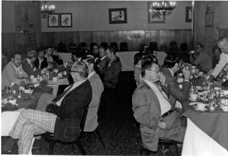
The "Early Risers" Breakfast during the Forum at Richmond.