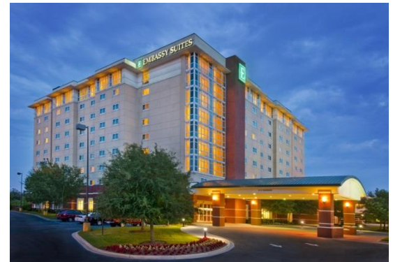
The Embassy Suites in North Charleston, site of the 2016 and 2017 Fall Conferences

After much negotiation and some high-powered wrangling, we have managed to secure the same very reasonable room rate this year that attendees enjoyed in 2016: only $139 per night! Reservations can be made now at our personalized Embassy Suites web portal .