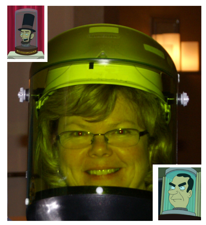
New president added to Futurama head museum.