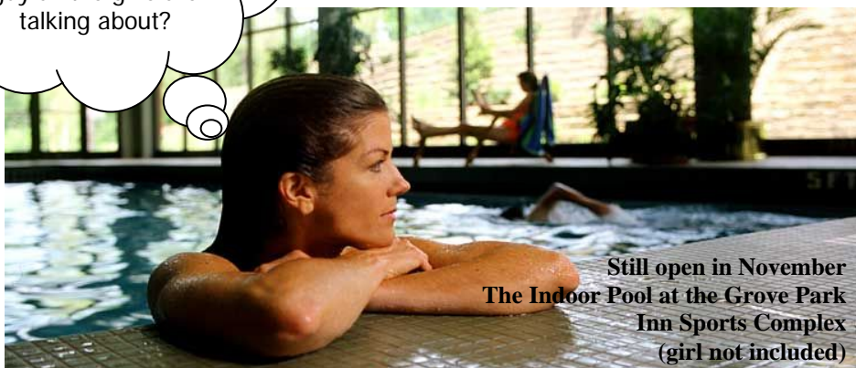
Still open in November The Indoor Pool at the Grove Park Inn Sports Complex (girl not included)