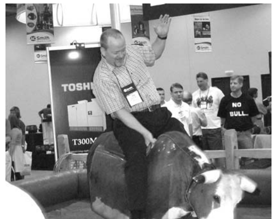
Fat old man with bad back risks life and limb to win T-shirt.

Do you know of another chapter member that is eligible for a "Years of Service" award, but is not listed here? How about an individual who has passed a milestone of years of service to our industry in 2008? Please contact the chapter office so that we can honor them also.